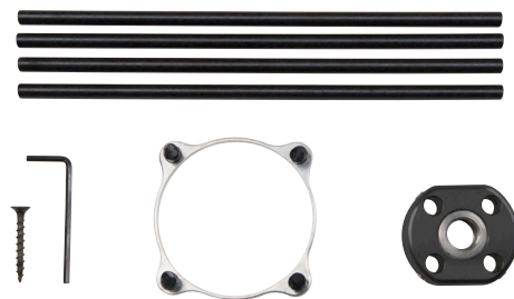
NEXO adhesive kit shown with Friction Wrist