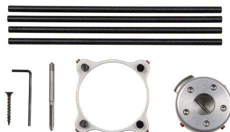
NEXO set screw kit shown with Quick Disconnect Wrist